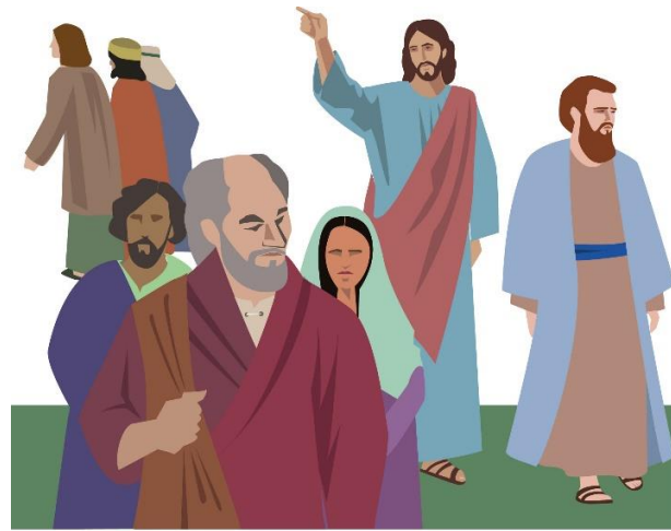
Jesus Sends Out His Disciples